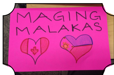
"Be Strong" in Tagalog